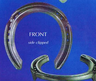
FRONT side clipped