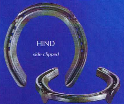
HIND side clipped

Available from all leading farrier supply stores throughout the USA